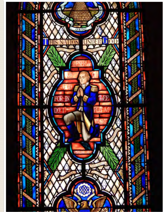
Congressional Prayer Room, US Capitol

Sponsored by Salt & Light Global and Stories in Stones Tour