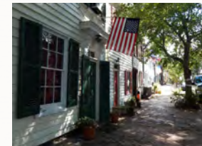
Old Town Alexandria