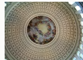
Apotheosis of Washington Dome of the Capitol