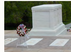
Tomb of the Soldier Known to God